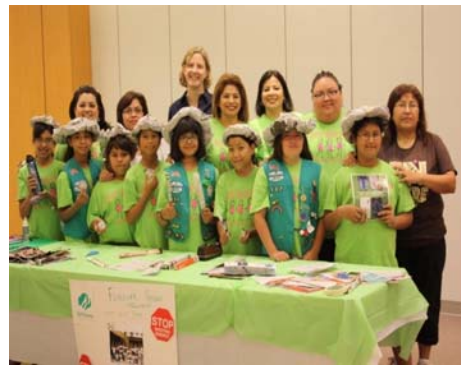
Corpus Christi Forever Green Event