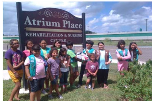
Valley Girl Scouts visiting a Nursing Home