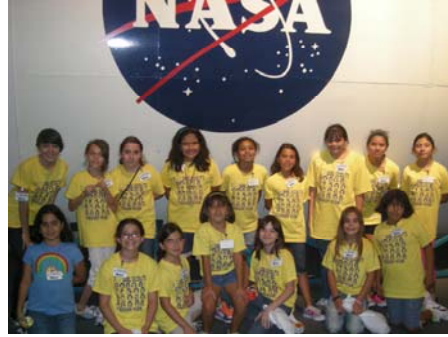
Laredo Girl Scouts visit NASA

From September 2009 through October 2010, Girl Scouts of Greater South Texas offered 52 program opportunities and 2,201 girls attended the programs with 1,044 adults volunteering.