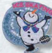
NEW! Iron-On Ice Skating Snowman 1¾" x 2" 58302 • $2.00