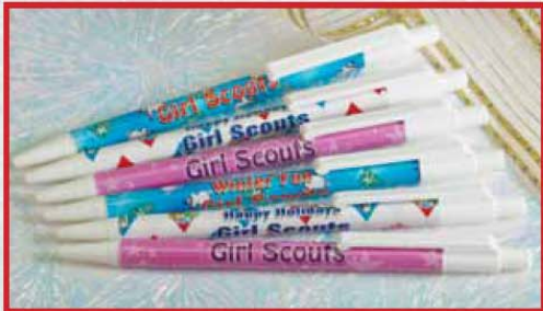
NEW! Holiday Click Pens. Retractable pens in blue, pink and white holiday designs. Black ink. Assorted, we'll select. Imported. 35084. $1.50.