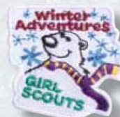
NEW! Sew-On Winter Adventures Polar Bear 2¼" x 2" 18039 • $1.50