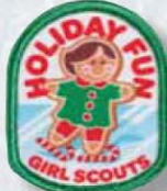
NEW! Sew-On Holiday Fun Gingerbread Girl 1¾" x 2¾" 18021 • $1.25