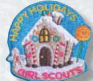
NEW! Iron-On Happy Holidays Gingerbread House 2" x 2" 58293 • $2.00