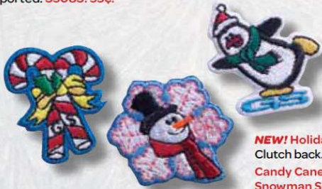
NEW! Holiday Embroidered Pins. Clutch back. Imported. $1.25. Candy Cane Pin. 11405. 1¼" x 7⁄8". Snowman Snowflake Pin. 11404. 1½" x 1½". Penguin Pin. 11403. 1½" x 1¼".