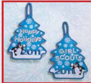
NEW! Penguin Embroidered Ornament. Greet the holidays with this adorable penguin ornament. With "Happy Holidays 2011" on one side and "Girl Scouts 2011" on the other side. Ready for hanging with attached cord. 3" x 2". Imported. 11486. $4.00.