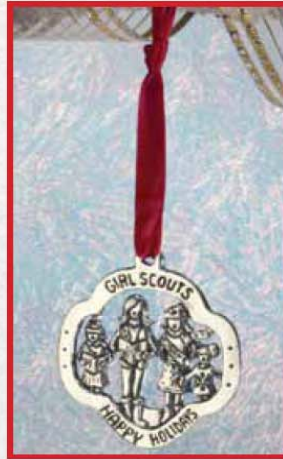
Caroling Pewter Ornament. Celebrate the holiday season with this shiny decoration depicting Girl Scouts caroling. Designed in the shape of the trefoil and hand-crafted in gleaming pewter. Makes a beautiful gift for Girl Scout friends or anyone on your list. 2½" x 2½". Imported. 11504. $16.00.