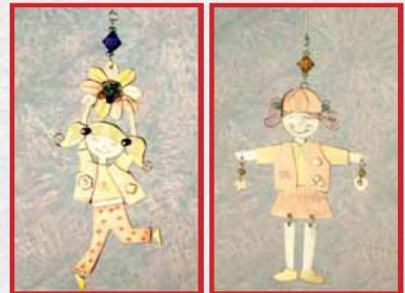
Holiday Metal Ornaments. In keeping with the holiday season are two adorable and whimsical ornaments. A jumping Girl Scout Daisy holding a daisy flower with colored beads and a happy, smiling Brownie with moveable legs. Both dressed in full uniform. Totally charming and adorable, you'll want to display them all year long. Hand-crafted in brass, copper and nickel with attached hook for hanging. Makes a wonderful collectible! Imported. Girl Scout Daisy. 5¼" H. 11506. $20.00. Girl Scout Brownie. 4¾" H. 11507. $20.00.