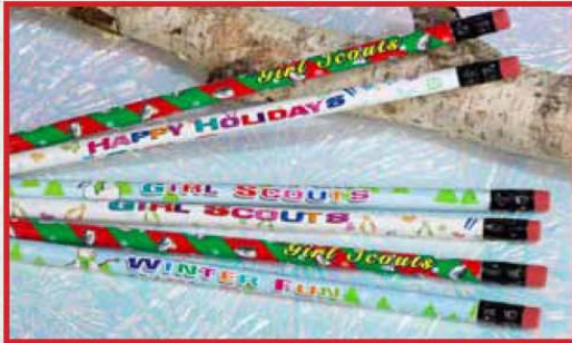
NEW! Holiday Fun Pencils. Three colorful holiday designs makes these pencils the perfect stocking stuffer. Assorted, we'll select. Imported. 35083. 55¢.