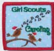
NEW! Sew-On Caroling Birds 1½" x 1½" 18003 • $1.50