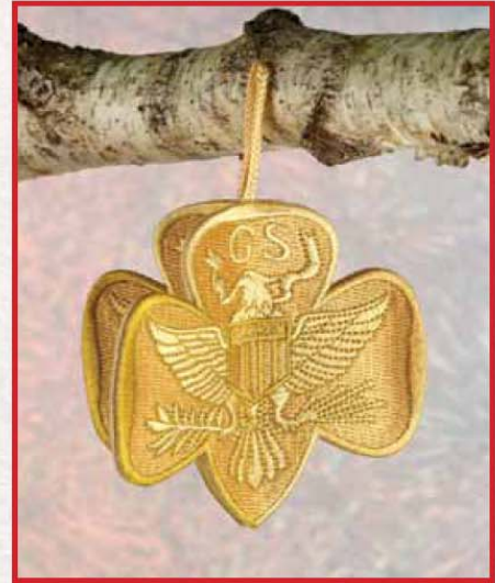
NEW! Traditional Logo 3D Ornament. This elegant ornament features the Girl Scout traditional logo embroidered in gold. With rope loop for hanging, this 3D ornament makes a beautiful gift. 3½" x 3½" x 3½". Imported. 11491. $14.00.