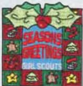
NEW! Sew-On Season's Greetings 1½" x 2" 18031 • $1.50