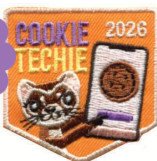
Cookie Techie Patch