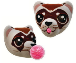
BFF Water Bottle Pouch + Topper OR Ferret Stress Ball