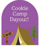
BFF Karaoke Set AND Cookie Camp Dayout!* OR Ferret Sleeping Bag AND Cookie Camp Dayout!* OR GS Bubble Bag with Matching GS Bucket Hat AND Cookie Camp Dayout!*

OR $100 Travel Reward OR $100 Camp Reward *Choose 1 Day: May 16th Bayview or June 13th Greenhill