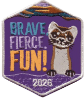
BFF Theme Patch