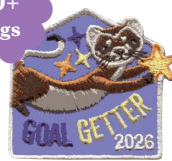
Goal Getter Patch