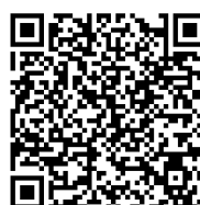
Girl Scout Digital Cookie Pledge