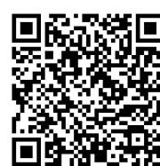
Girl Scout Cookie and Product Sale Safety Activity Checkpoint