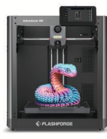
Meta Quest 3S Headset OR 3D Printer