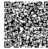
DC Delivery Settings