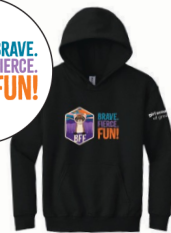
Hoodie Sweater OR Plush Ferret Backpack