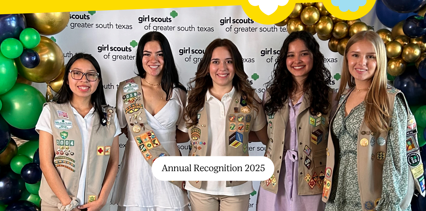
Annual Recognition 2025