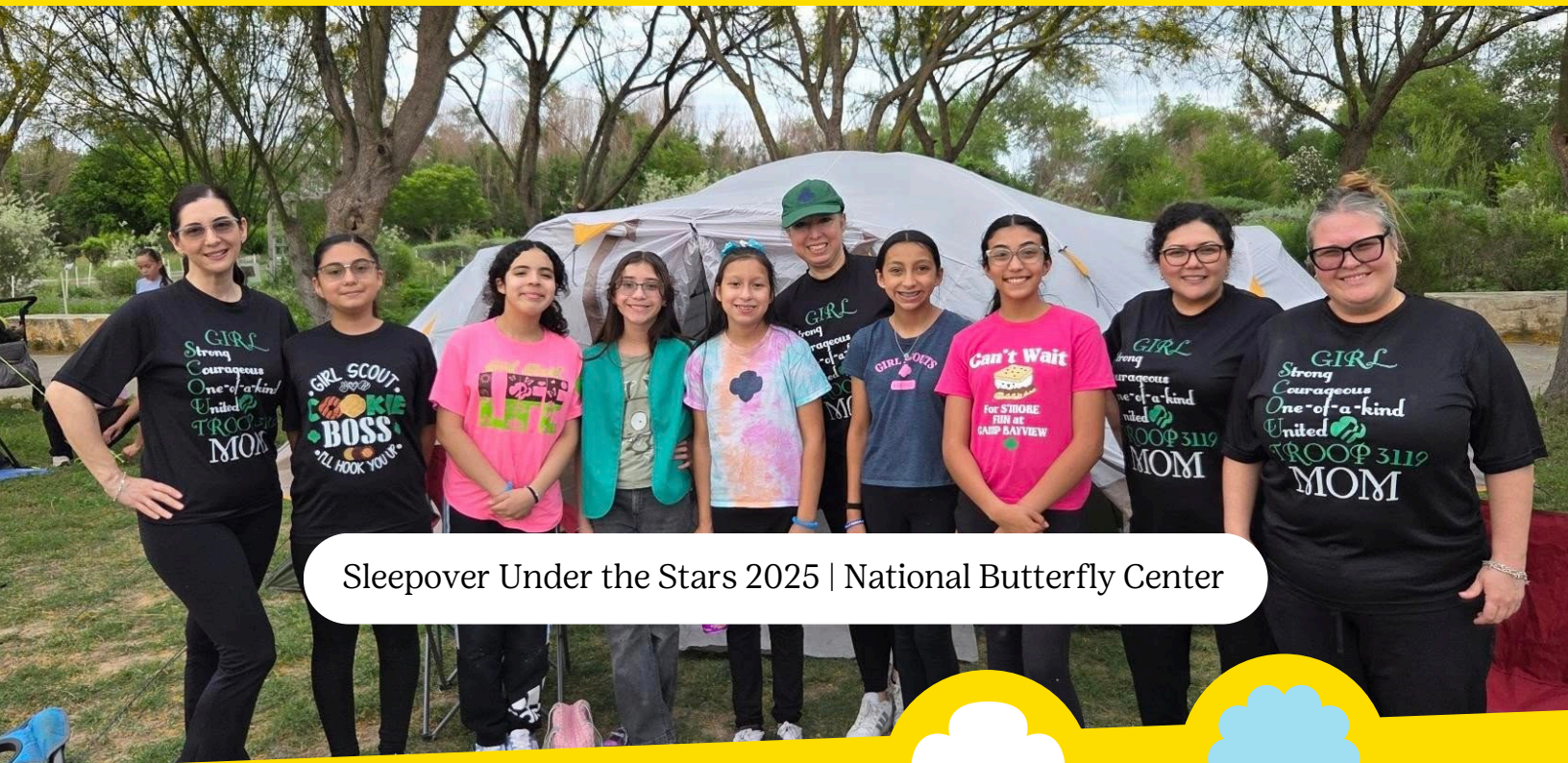
Sleepover Under the Stars 2025 | National Butterfly Center